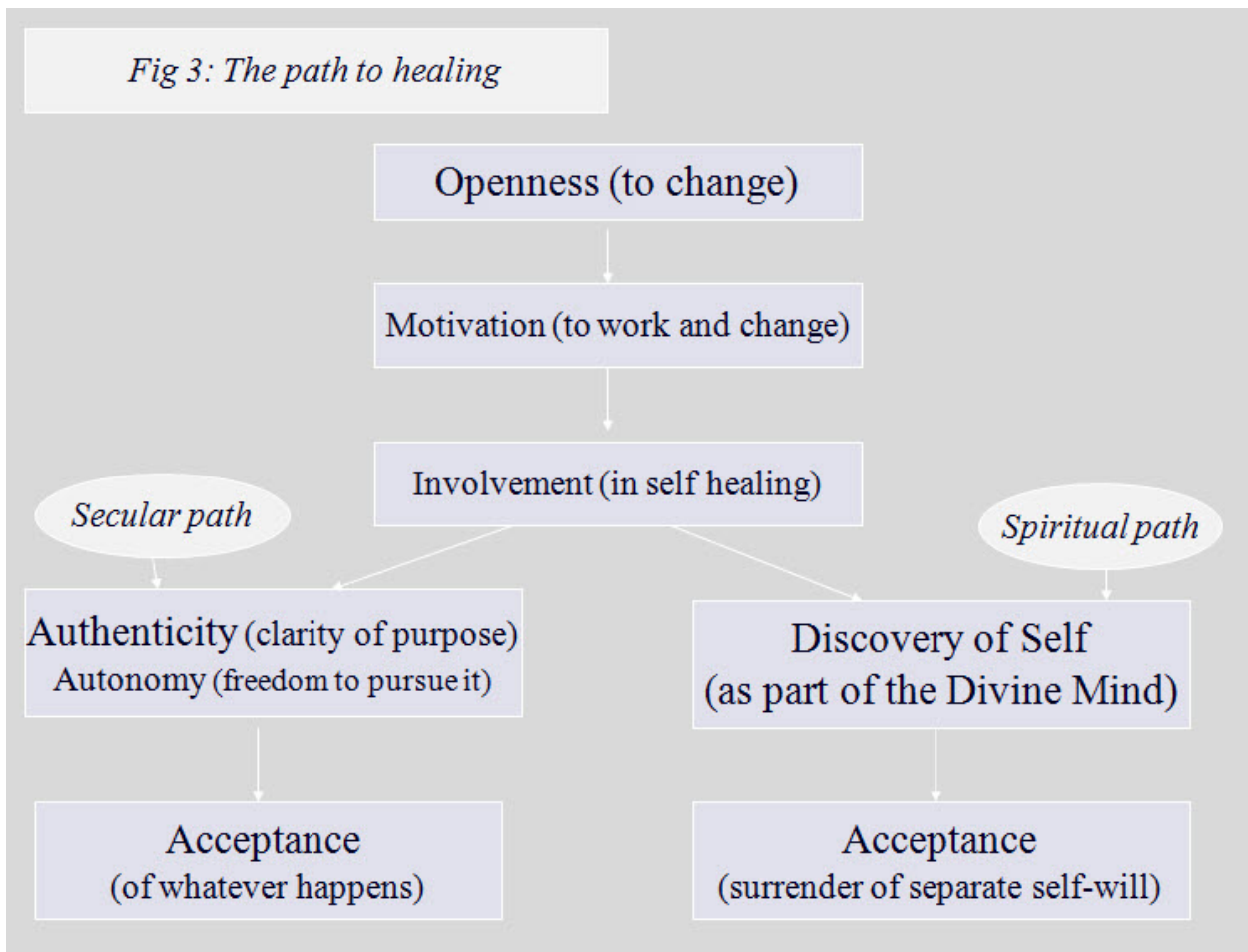
Fig 3: The path to healing